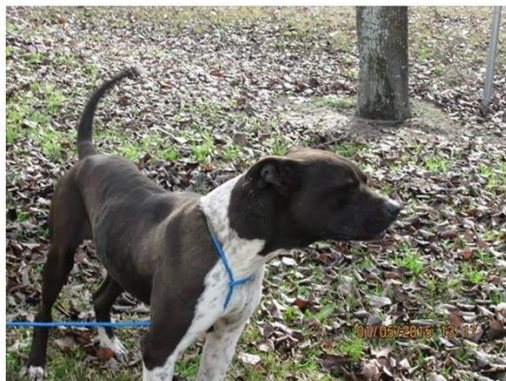
Urgent Dogs of Columbus County Animal Shelter, NC

Is there really no one for this wonderful boy? He DIES by heart stick at 7 a.m. TOMORROW Friday morning without rescue/foster commitment. FULLY FUNDED at $300 in sponsorship. Please share to save his life. CCAC in Whiteville, NC.